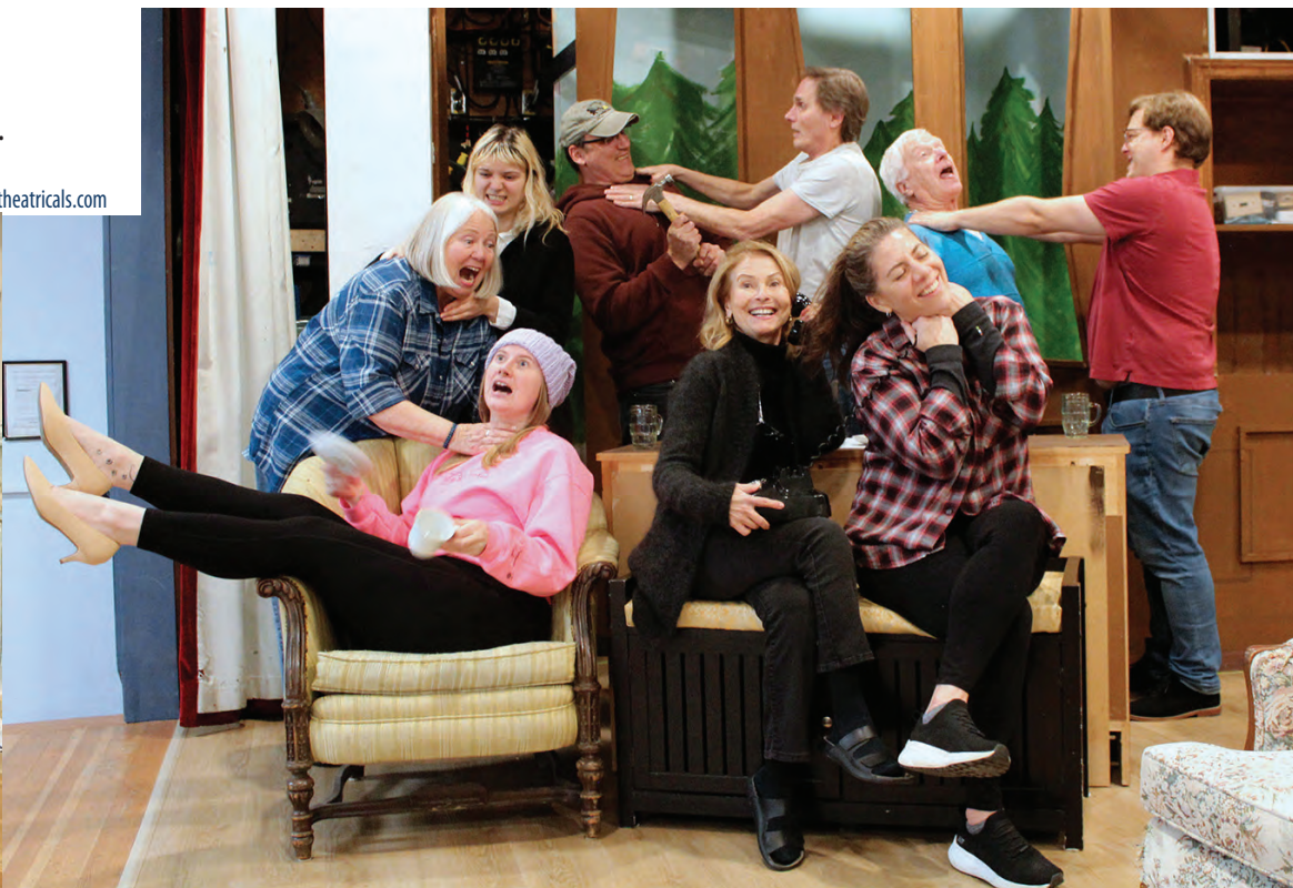
While the set building/painting team are hard at it, the cast is not having any fun at all. Actually, all of them are enjoying themselves a great deal!