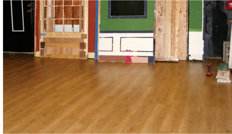
New vinyl floor laid and flats returned to the wings

The call went out for volunteers to help clear the stage before the work and then replace everything after the new floor was laid.