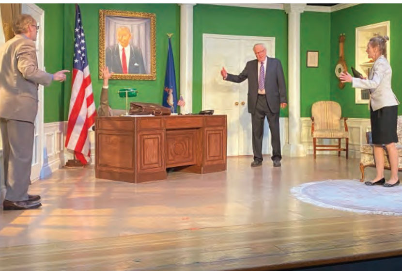
The set for "The Outsider" on the old floor

However, as set builders, painters, set dressers and others who spend much time kneeling and working close to the stage floor, we have become increasingly aware that the tiles are cracking, breaking and coming up in large chunks!