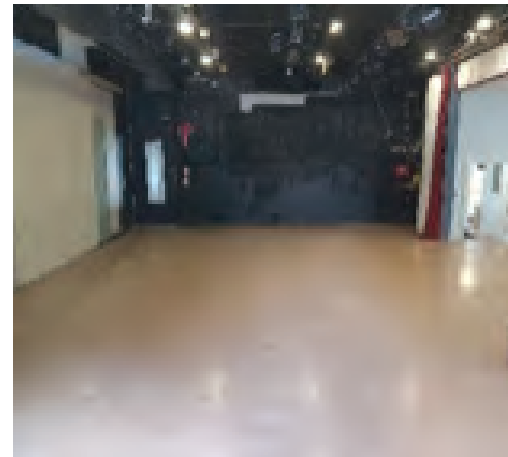
Stage totally bare — ready for new floor to be laid

This project meant clearing absolutely everything off the stage floor, as the new vinyl would extend out to the perimeter walls. Therefore, our stock of stored wall flats, door flats, archways, ladders, saws and other set building "stuff" would have to be temporarily moved down into the hall, so that the work could take place on the stage.