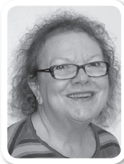
Cher Owen Set Design