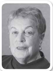
Merry Hallsor Properties