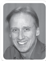
Mitch Barnes Sound Design