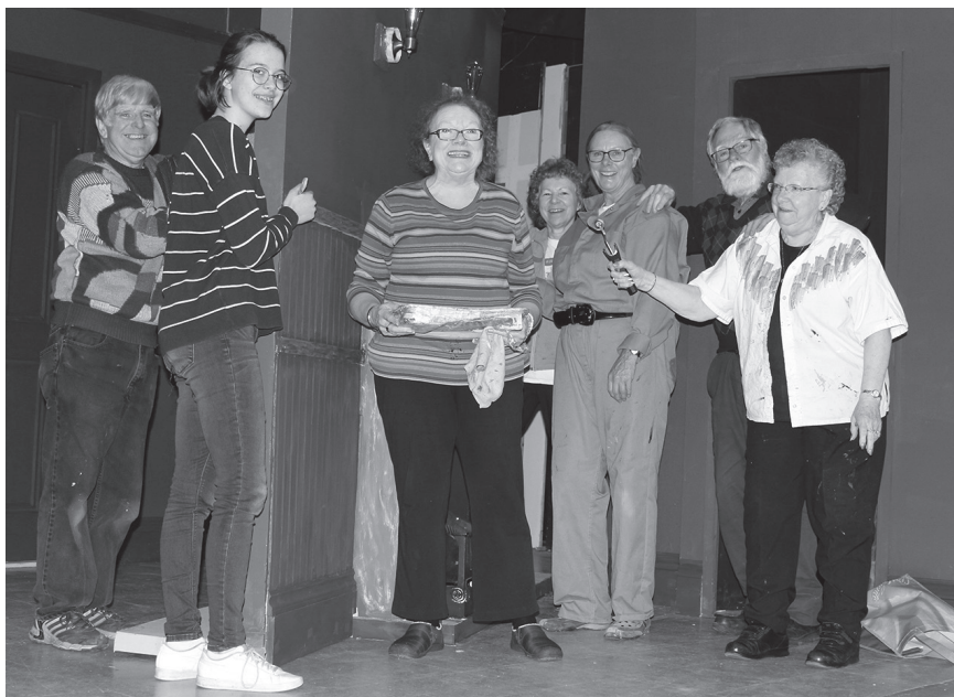
But a few of our wondrous set construction and painting people