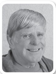
Carol-Anne Moore Lighting Design