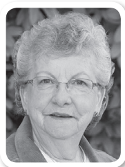
De Roger Set Decor & Painting