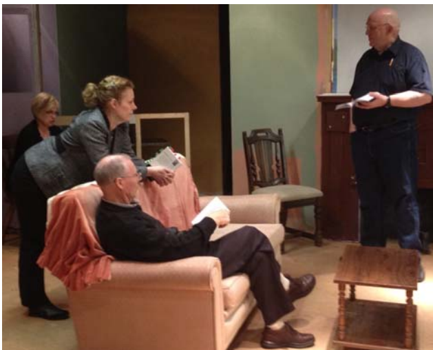
Rehearsals and Set Construction